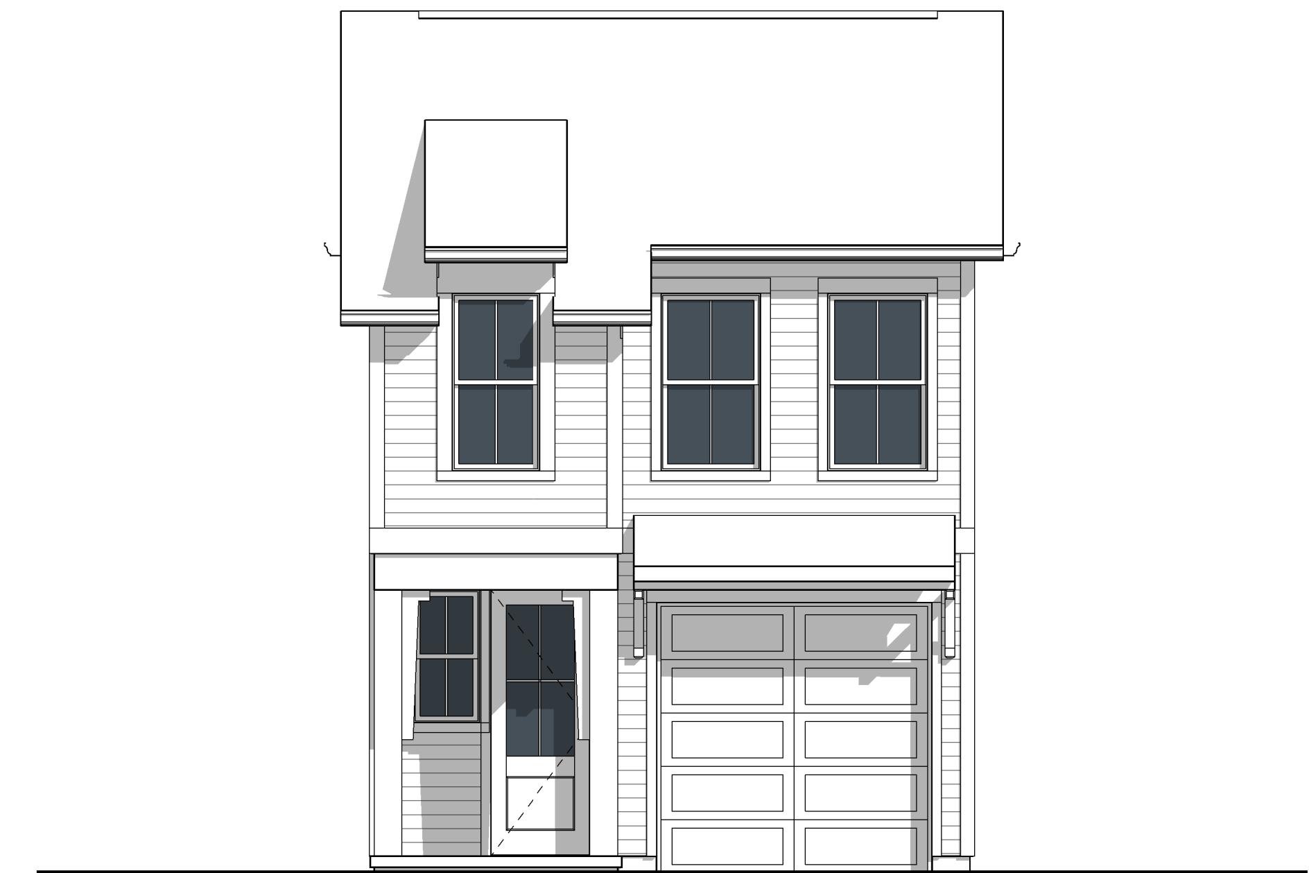
3 FRONT ELEVATION 1/4" = 1'-0"