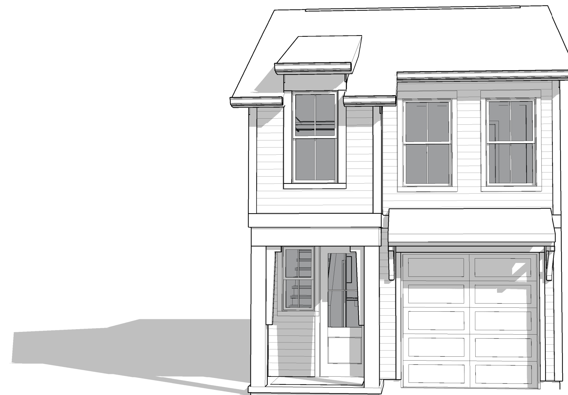
4 PERSPECTIVE VIEW