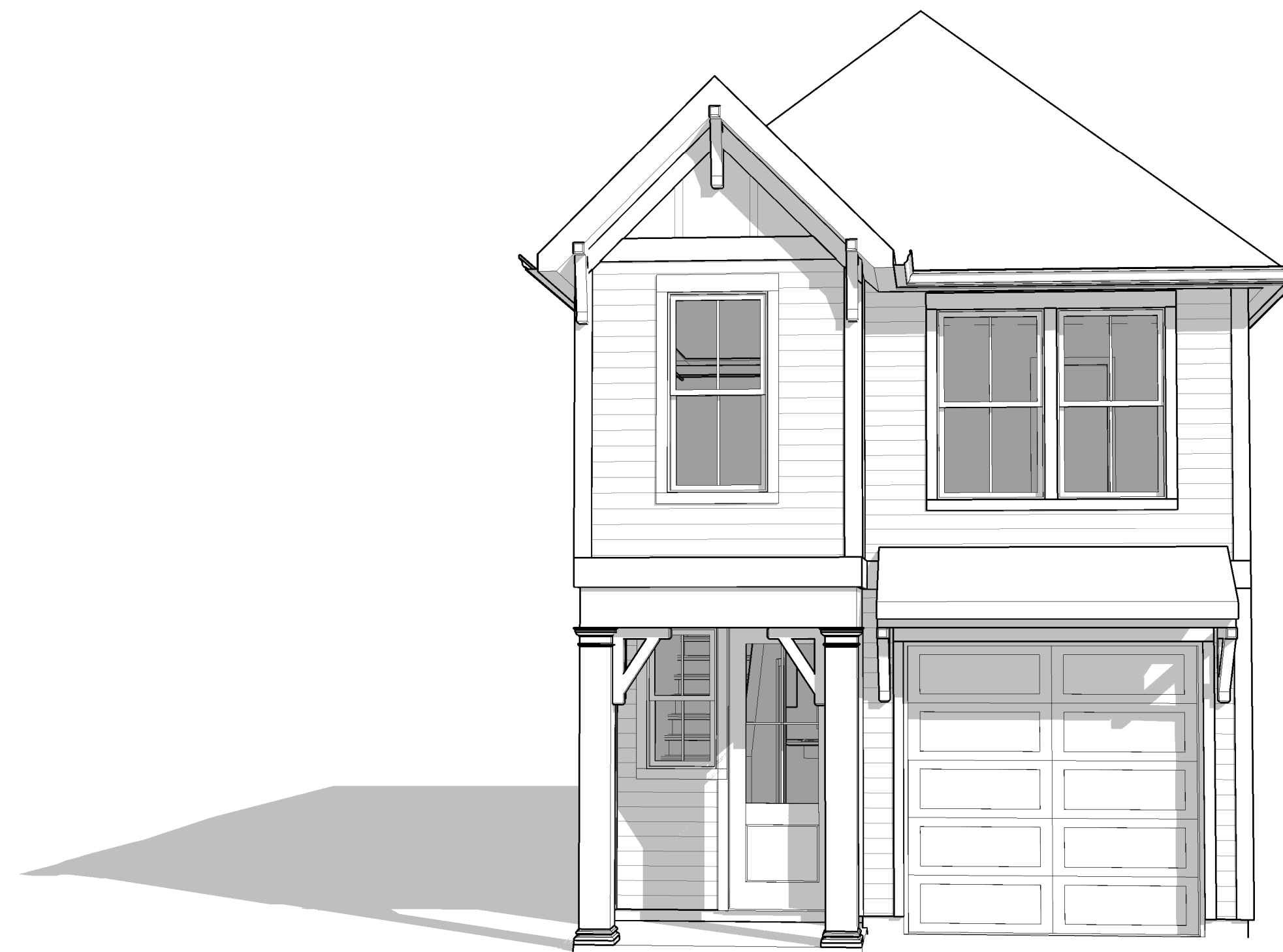
4 PERSPECTIVE VIEW