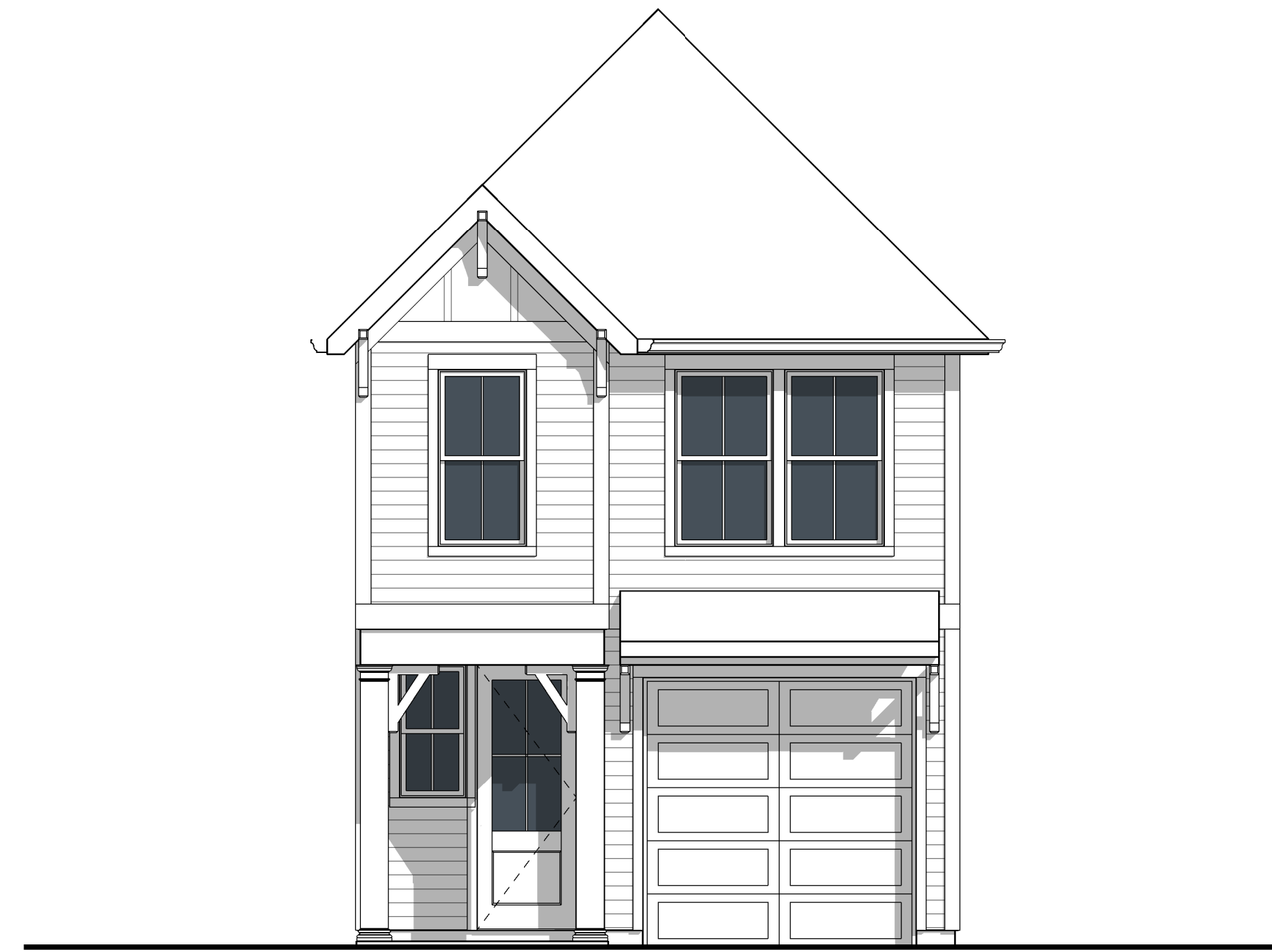
3 FRONT ELEVATION 1/4" = 1'-0"