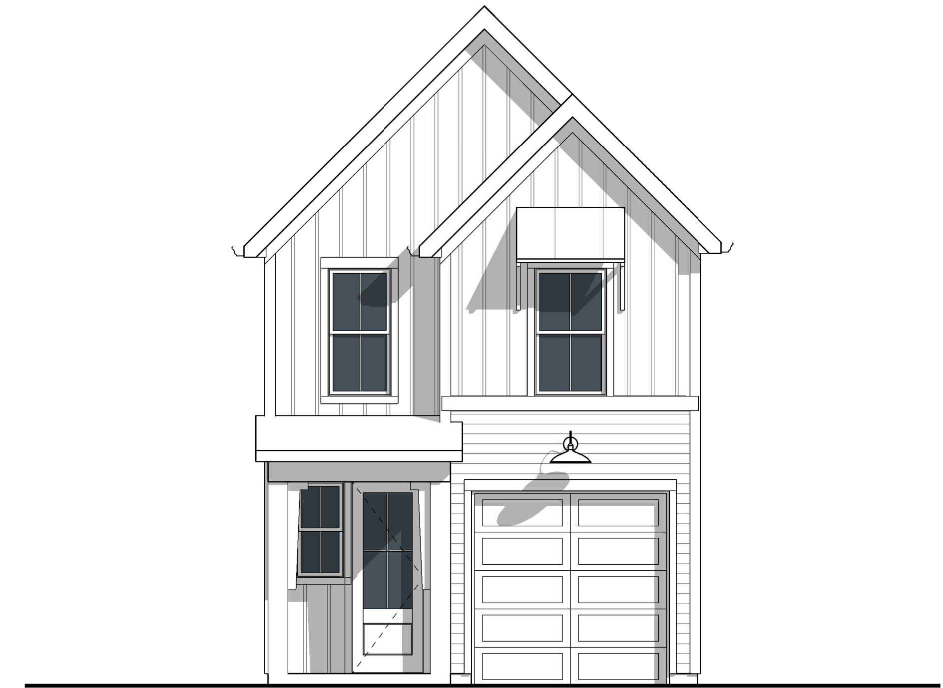
3 FRONT ELEVATION 1/4" = 1'-0"