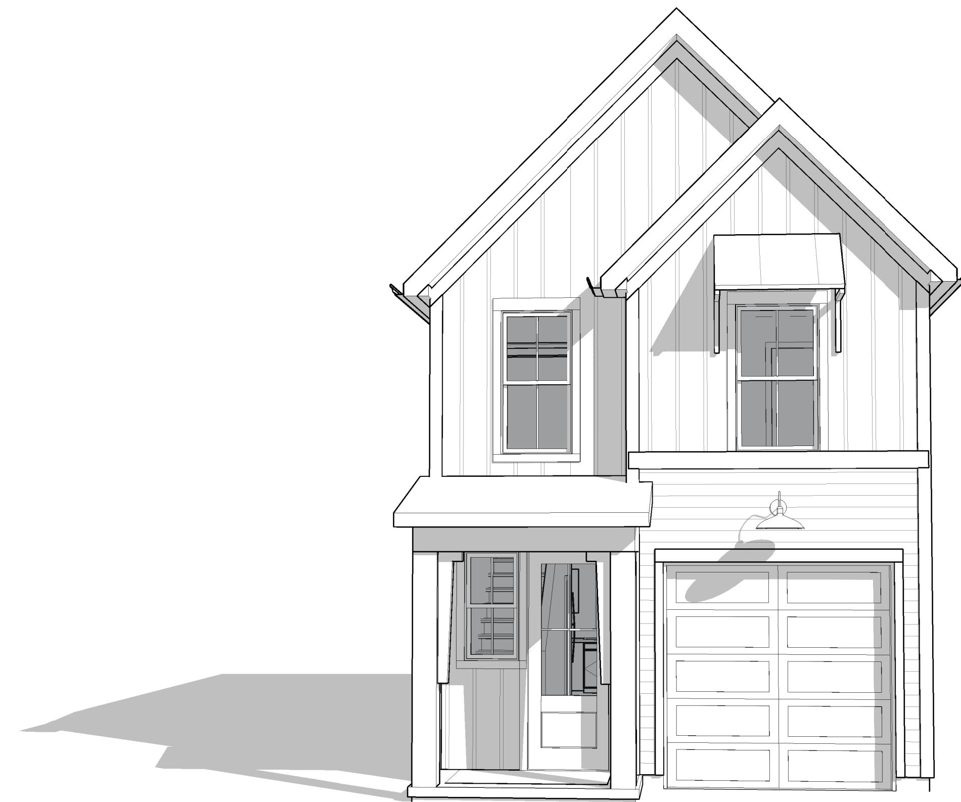
4 PERSPECTIVE VIEW